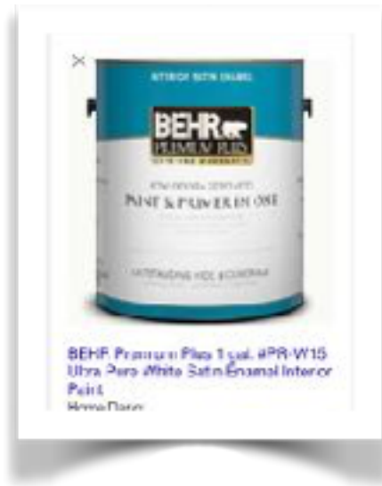
Behr Ultra Pure White (Satin)